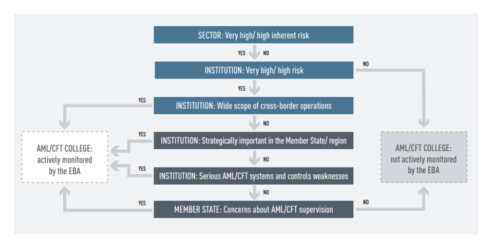
Figure 3: The EBA's decision tree when selecting AML/CFT colleges for active monitoring.